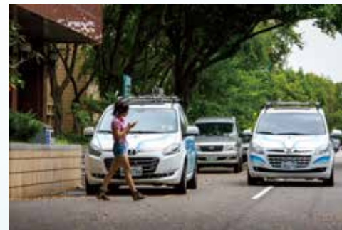
Pedestrian in Driver Non-Line of Sight