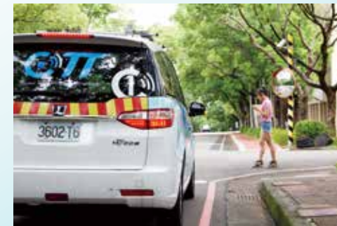
Pedestrian in Driver Line of Sight